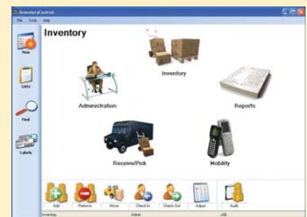
► Main Screen